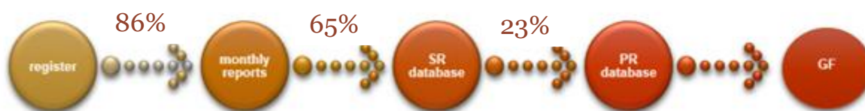
Figure: Misreported data between all layers

The audit noted significant errors in data at the different levels of the data collection and aggregation process which affect quality of the results reported to the Global Fund as shown below: