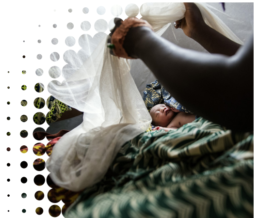
A mother puts up a mosquito net in N'Tabakoro, Kulikoro, on the outskirts of Bamako. Mali was one of the first countries in Africa to pilot new mosquito nets to combat insecticide-resistance.

Together with Mali's Ministry of Health, the Association pour la Résilience des Communautés vers l'Accès au Développement et à la Santé Plus, Catholic Relief Services and key technical and financial partners, the Global Fund is supporting interventions that aim to halve incidence rates for HIV and malaria, reduce TB incidence by 30%, and achieve a 50% reduction in mortality rates for the three diseases in the coming years. Global Fund investments also support Mali to strengthen pandemic preparedness and to enhance systems that will help the country withstand future health threats.